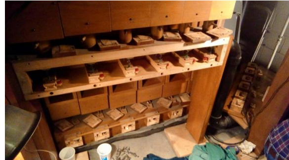
Bourdon offset primary pneumatics exposed

resoldering of string offset contacts at our April 10 th work party.